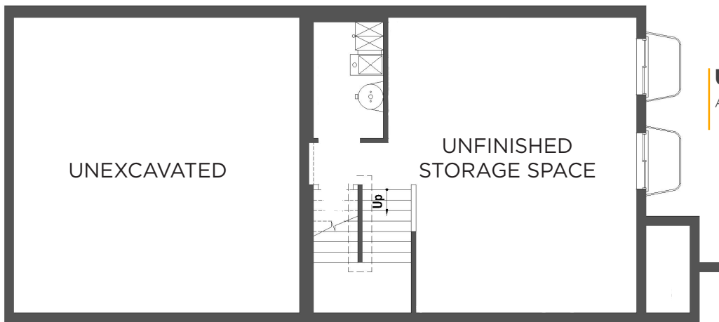
UNFINISHED BASEMENT Approx 546 Sq. Ft.